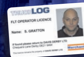
Sample Drivers Licence Smart Card

Why not use the same card to control access to your vehicles? Our electronic drivers licence can be combined with other compatible applications in to a single multifunctional card.