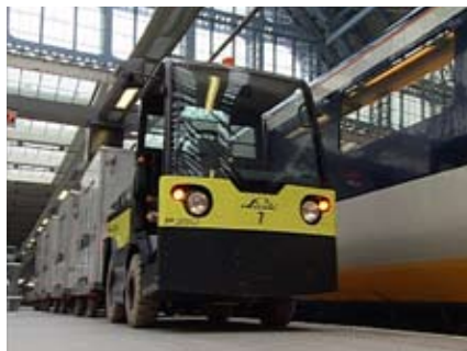
TruckLOG in action at St Pancras Station

The company entered into an agreement with Texas Instruments to develop a radio Frequency Identification (RFID) system to track miners and vehicles in mines, significant orders for this new system were won in the UK for use in mines and on oil and gas platforms, systems were also sold in China.