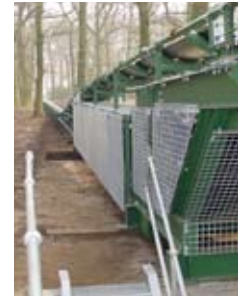
StedFAST conveyor protection products

Davis Derby continued to develop new products for the mining industry but also set about to diversify into new markets. Examples include inductive charging systems for electric vehicles, radio frequency identification systems to automatically track the position of personnel vehicles and other assets.