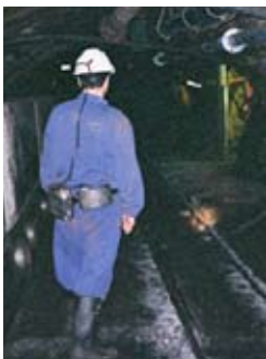
MineWATCH RFID Systems

1972 witnessed the launch of the two products that were to be very significant to the future of Davis Derby. These were the DIS 4 loudspeaker Communication System and the Sivad MK II Coal Face Signalling and Communication System. The company continued to expand during the next decade and by 1980 some 1200 Sivad MK II Systems had been sold worldwide. The British Coal industry was in phase of considerable investment throughout the late 1970's. The company developed a new Telemetry Unit in 1978, which was destined to become one of the Company's most successful products.