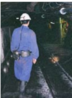
MineWATCH RFID Systems

and by 1980 some 1200 Sivad MK II Systems had been sold worldwide. The British Coal industry was in phase of considerable investment throughout the late 1970's. The company developed a new Telemetry Unit in 1978, which was destined to become one of the Company's most successful products.